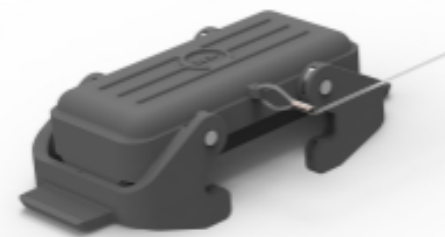
TE Part # T1010241200-000 H24B-KDTP