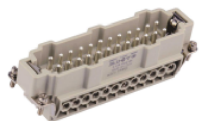
TE Part # T2040242101-000 HE-024-M