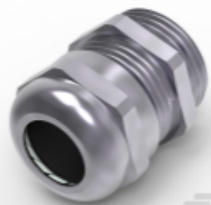
TE Part # T3609210101-000 DLX-21-MS